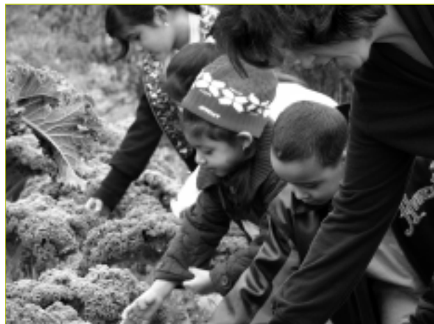
Preschool students visit a local farm to explore and learn about how their food is grown.

Isles' Ready, Set, Grow (RSG) project brings a new way to encourage pre-school families to adopt new eating habits – and set their children on a path to lifelong health.