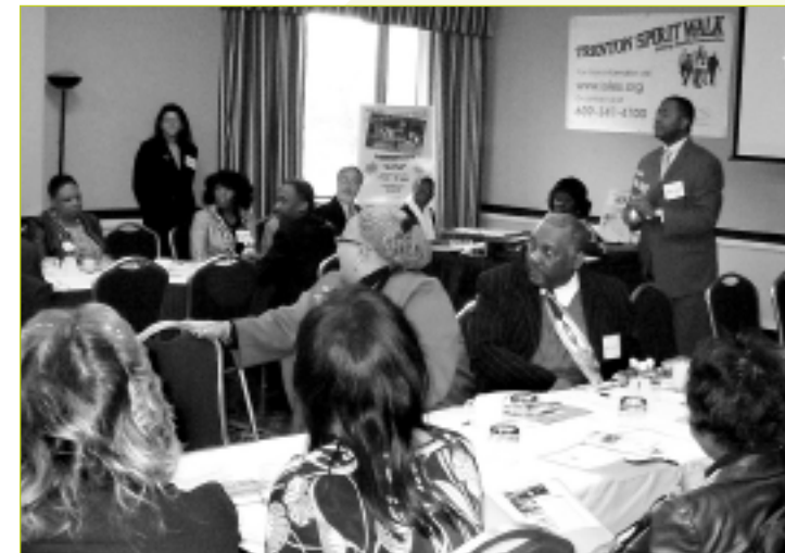
New Jersey and Trenton area leaders come together at Isles' Faith for Health Breakfast, to discuss childhood obesity and our role in preventing the epidemic.