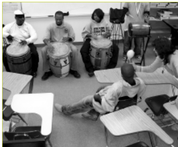
Students participate in Bomba, a Puerto Rican and African drumming workshop.

Over the past several months, IYI students and alumni have been introduced to several dynamic programs that have exposed them to new experiences and learning opportunities.