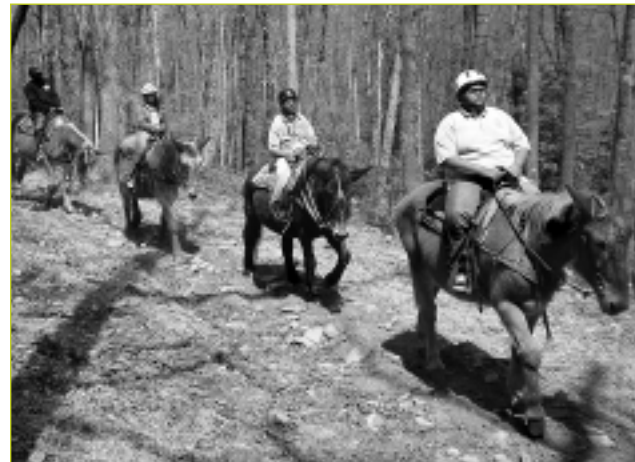
IYI students ride horses during their four day teambuilding retreat in the Poconos.

The Food Basics project led by personal Chef Elizabeth Stelling from Cook Appeal in Princeton, is another IYI EEP component that has been well received by IYI students. Upon completion of the project, students will earn a certificate that demonstrates their understanding of the basics of food preparation, cutting, kitchen safety, restaurant kitchen basics, menu development, and nutrition. Participants in the Food Basics project will be prepared for entry level employment in a restaurant. To assist IYI students and alumni with reaching their full potential, the IYI EEP is offering a 12-week