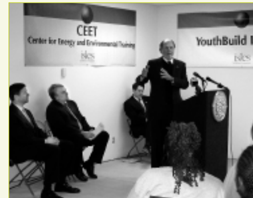
Governor Corzine speaks to YouthBuild students, NJCEET graduates, and others about a new statewide effort to train and create green-collar jobs.

Since CEET's opening in mid-January, 146 trainees completed an Energy Efficiency Assistant course developed by CEET and the Conservation Services Group in Massachusetts. This entry-level course provides green job classes and field site