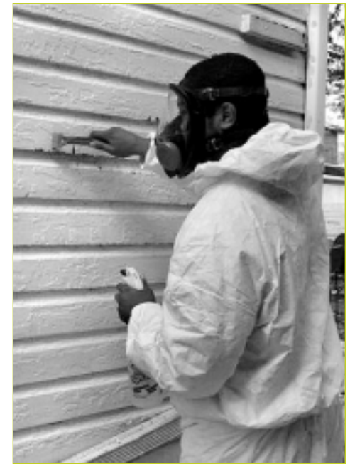
A Healthy Homes inspector performs lead abatement on a Trenton home.