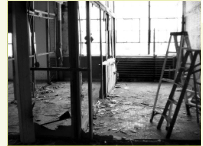
A work in progress, Isles' Mill One at One Johnston Avenue is slated for completion in late 2010.

WE HAVE A NEW WEBSITE...TAKE A LOOK! www.isles.org