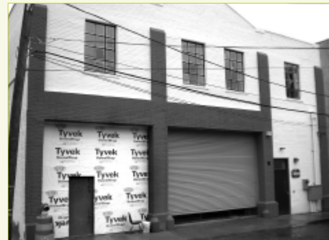
Tucker Street getting a facelift. Sponsors include NRG Energy, NJ Board of Public Utilities, SunPower and SJ Industries.

After a year spent renovating the 20,000 sq ft former factory, Isles is poised to announce the completion of Isles' Training Center at 33 Tucker Street in Trenton. The extraordinary generosity of NRG Energy made the complete renovation possible. Headquartered in Princeton, New Jersey, NRG is a global energy company that donated over $1,000,000 to make this renovation possible. Founded in