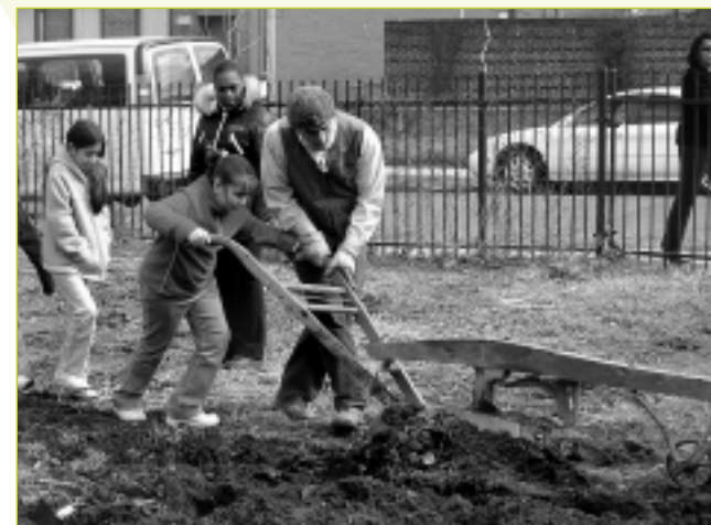
To kick-off the 2009 gardening season, students from Grant Elementary School in Trenton experienced farming the old fashioned way during Isles' annual Spring Tillage event.